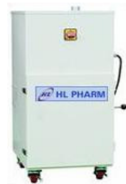
Capsule Polishing Machine