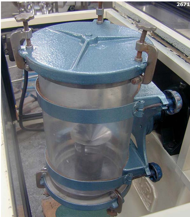
Power blender/shaker TP ENGINEERING type FE FS