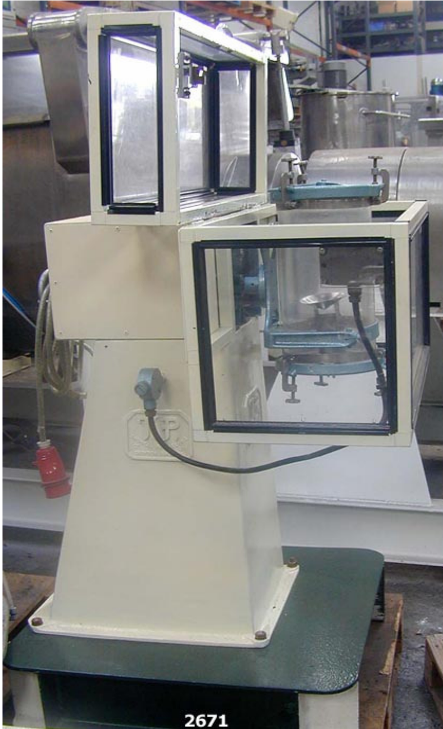
Power blender/shaker TP ENGINEERING type FE FS

Overall dimensions 760 x 760 x 1300mm high.